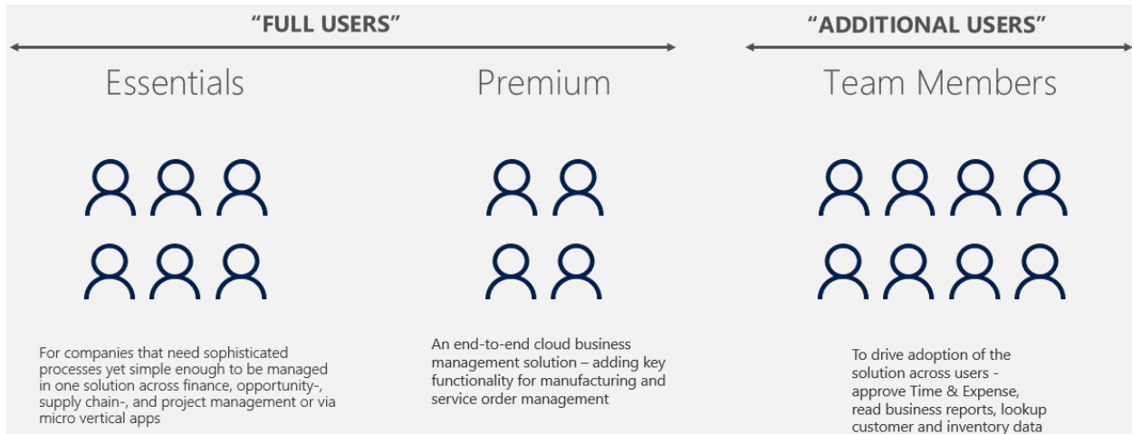
Figure 3: User Types